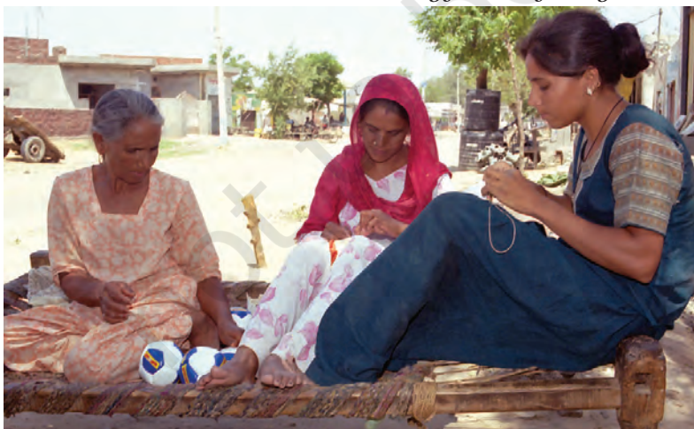
Women at home in Ludhiana making footballs for large MNCs

There's another way in which MNCs control production. Large MNCs in developed countries place orders for production with small producers. Garments, footwear, sports items are examples of industries where production is carried out by a large number of small producers around the world.