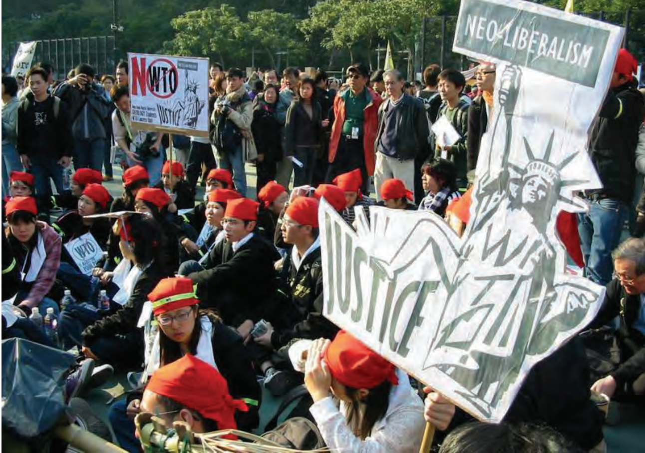
A demonstration against WTO in Hong Kong, 2005