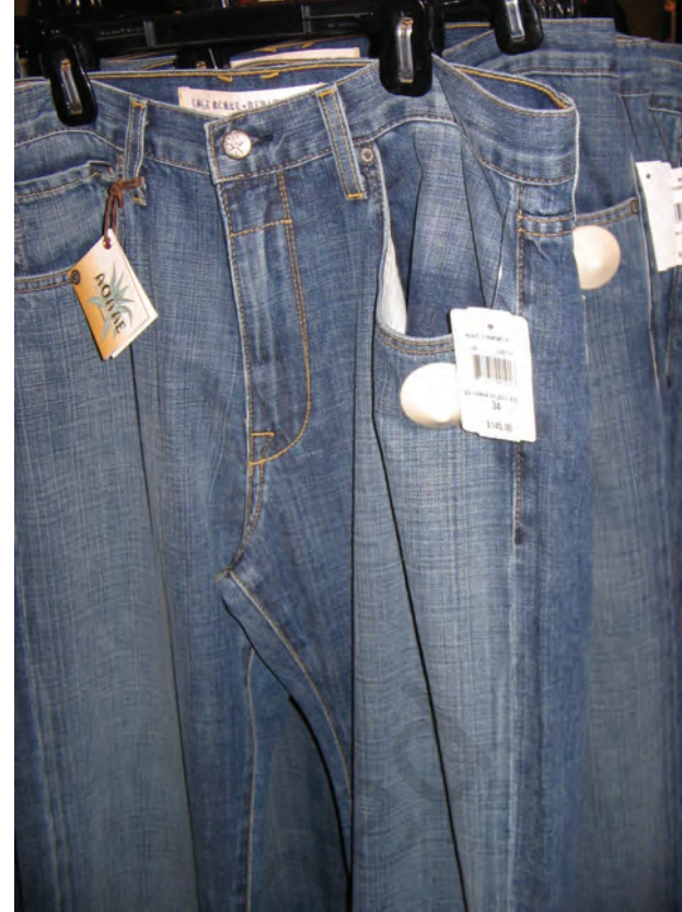
Jeans produced in developing countries being sold in USA for Rs 6500 ($145)

The products are supplied to the MNCs, which then sell these under their own brand names to the customers. These large MNCs have tremendous power to determine price, quality, delivery, and labour conditions for these distant producers.