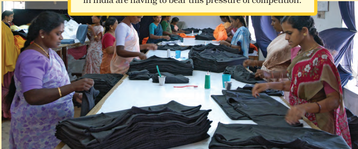
Factory workers folding garments for export. Though globalisation has created opportunities for paid work for women, the condition of employment shows that women are denied their fair share of benefits.

Let us see how the workers in the garment export industry in India are having to bear this pressure of competition.