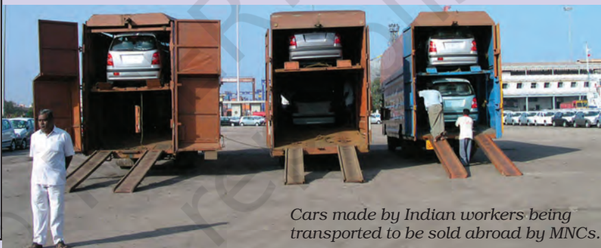
Cars made by Indian workers being transported to be sold abroad by MNCs.