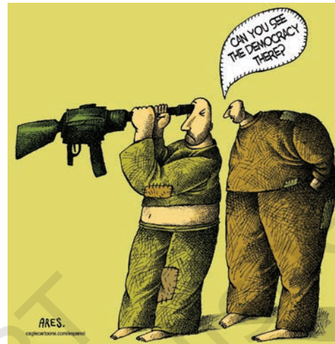
Seeing the democracy