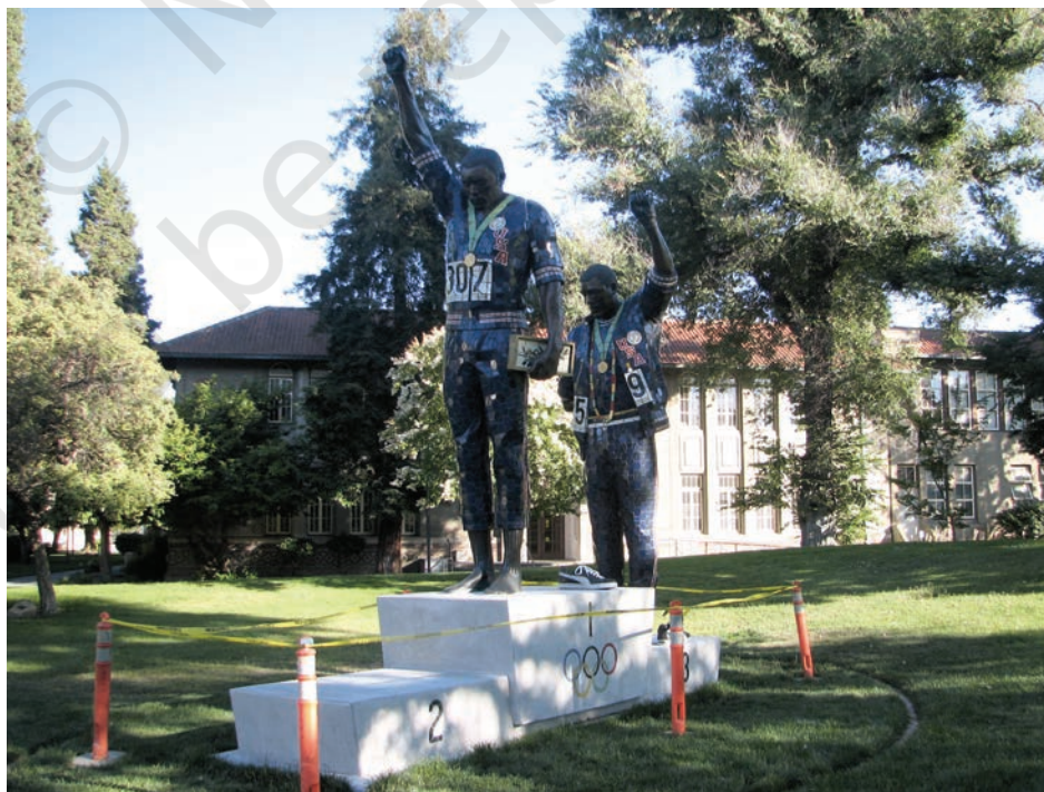
In 2005, the San Jose State University installed a 20-foot high sculpture representing the protest by Tommie Smith and John Carlos. A photograph of the original medal ceremony in 1968 is on the top.

Do you think that Carlos and Smith should have raised an internal matter of American society in an international forum? Would you say that what they did was political? Why do you think Peter Norman, who was neither Black nor American, joined in the gesture of protest? If you were in Norman's place what would you do?