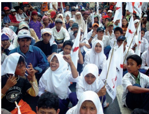
Land rights protest: farmers of West Java, Indonesia. In June 2004, about 15,000 landless farmers from West Java, travelled to Jakarta, the capital city. They came with their families to demand land reform, to insist on the return of their farms. Demonstrators chanted, "No land, No vote" declaring that they would boycott Indonesia's first direct presidential election if no candidate backed land reform.