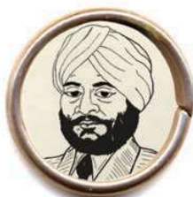
Baldev Singh (1901-1961)

born: Haryana. A successful entrepreneur and leader of the Panthic Akali Party in the Punjab Assembly. A nominee of the Congress in the Constituent Assembly. Later: Defence Minister in the Union Cabinet.