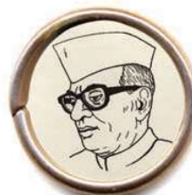
Kanhaiyalal Maniklal Munshi

Constituent Assembly at the stroke of midnight on 15 August 1947: