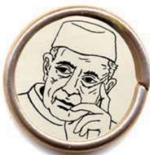
Jawaharlal Nehru (1889–1964) born: Uttar Pradesh. Prime Minister of the interim government. Lawyer and Congress leader. Advocate of socialism, democracy and anti-imperialism. Later: First Prime Minister of India.