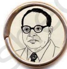
Bhimrao Ramji Ambedkar

(1887-1971) born: Gujarat. Advocate, historian and linguist. Congress leader and Gandhian. Later: Minister in the Union Cabinet. Founder of the Swatantra Party.