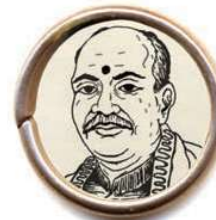
Shyama Prasad Mukherjee

(1891-1956) born: Madhya Pradesh. Chairman of the Drafting Committee. Social revolutionary thinker and agitator against caste divisions and caste based inequalities. Later: Law minister in the first cabinet of post-independence India. Founder of Republican Party of India.