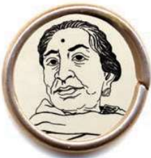
Sarojini Naidu (1879–1949) born: Andhra Pradesh. Poet, writer and political activist. Among the foremost women leaders in the Congress. Later: Governor of Uttar Pradesh.