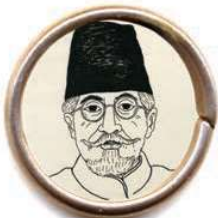
Abul Kalam Azad

(1888–1958) born: Saudi Arabia. Educationist, author and theologian; scholar of Arabic. Congress leader, active in the national movement. Opposed Muslim separatist politics. Later: Education Minister in the first union cabinet.