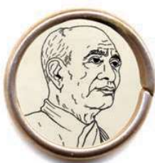
Vallabhbhai Jhaverbhai Patel

(1875–1950) born: Gujarat. Minister of Home, Information and Broadcasting in the Interim Government. Lawyer and leader of Bardoli peasant satyagraha. Played a decisive role in the integration of the Indian princely states. Later: Deputy Prime Minister.