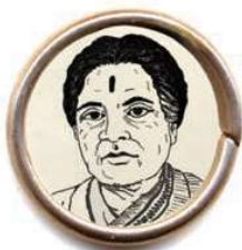
G. Durgabai Deshmukh (1909-1981)

born: Andhra Pradesh. Advocate and public activist for women's emancipation. Founder of Andhra Mahila Sabha. Congress leader. Later: Founder Chairperson of Central Social Welfare Board.